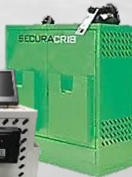
SecuraCrib & SecuraPort

High Tech Affordable & Portable Inventory Management