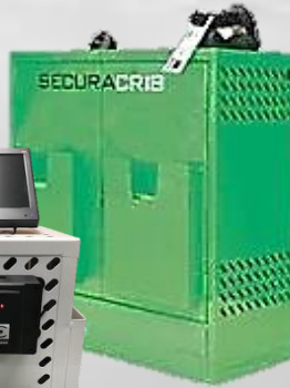
SecuraCrib & SecuraPort

High Tech Affordable & Portable Inventory Management